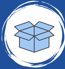
Cardboard or paper